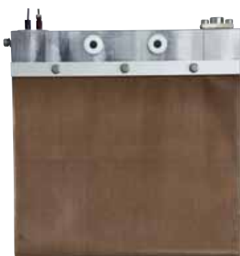
Singur cap Single Head Утюг