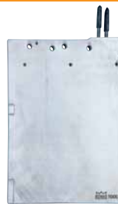
KB 512 Singur cap (Noua) Single Head (new) KB 272 Doua capete (Noua) Double Head (new) новая модель