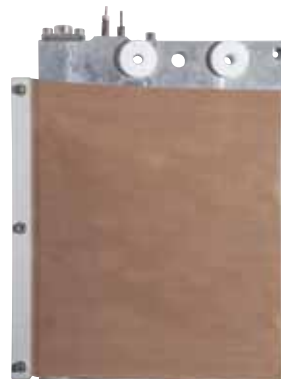
Doua capete Double Head Утюг