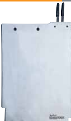
Patru capete (Noua) Quad Head (new) новая модель