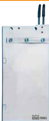
Singur cap (Veche) Single Head (old) старая модель