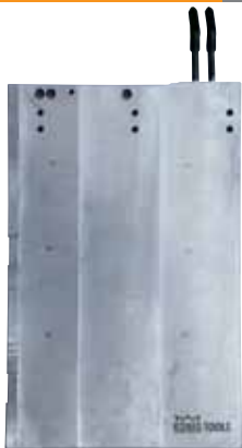
Doua capete (Noua) Double Head (new) новая модель