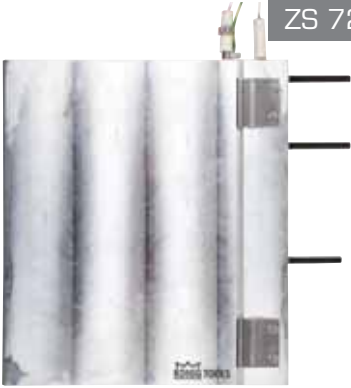
Un cap - Doua capete Single Head, Double Head Утюг