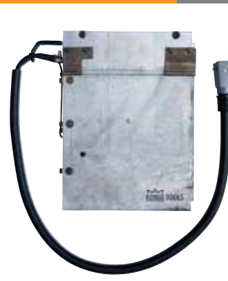
Patru capete Quad Head утюг