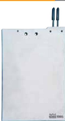
Patru capete (Noua) Quad Head (new)