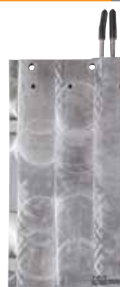
Doua capete (Veche) Double Head (old) старая модель