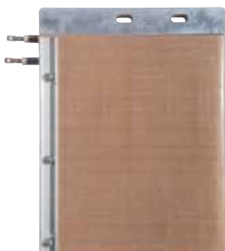
Rezistenta Heating plates утюг