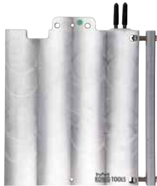
Patru capete (Veche-Fara treptat) Quad Head (old) старая модель