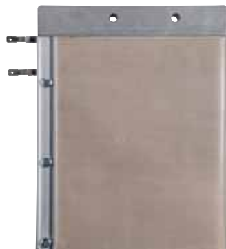
Rezistenta Heating plates утюг