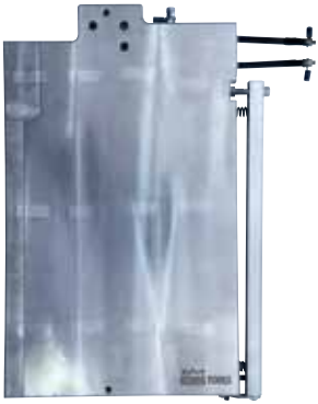
Un cap - Doua capete (Treptat) Single Head / Double Head