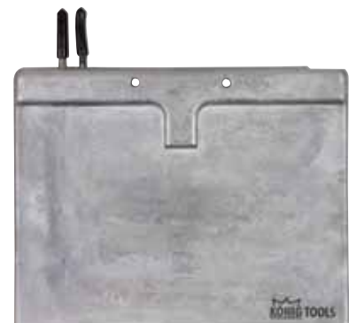
Singur cap Single Head Утюг