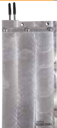
Doua capete (Veche) Double Head (old) старая модель