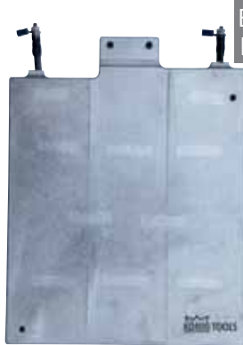
Kaban 255 x 220 mm BD 2030 BD 2100 BD 2010 FA 1040