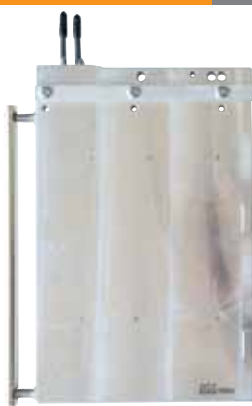
Doua capete (Noua cu arc) Double Head (new) новая модель