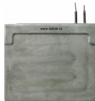
Rezistenta universal Heating plates утюг