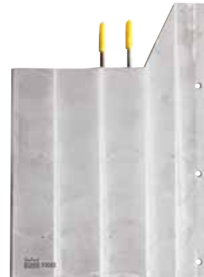
Singur cap Single Head Утюг