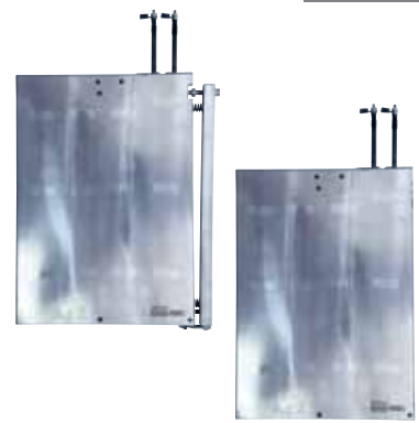
Doua capete (Fara treptat) Double Head новая модель